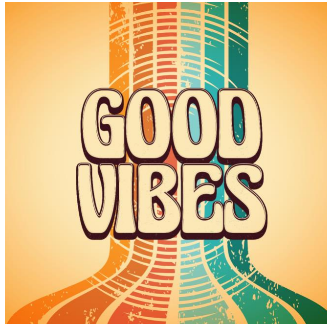
(Click here to download)