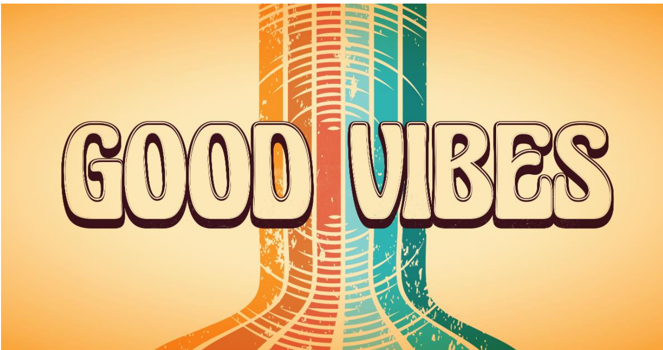
(Click here to download)